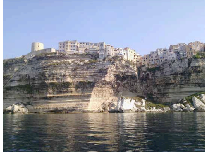
(L) Rome moorings July evening – (R) Bonifacio Corsica July Morning