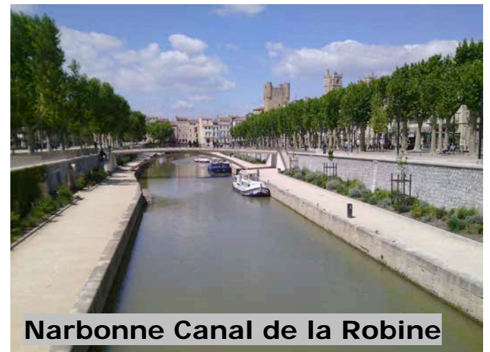
Narbonne Canal de la Robine